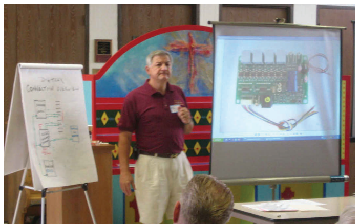
The Scottsdale Model Railroad Club's three presenters gave a clinic on DCC Train Control, Reporting and Occupancy Detection.

Account Balance as of June 22, 2007 $ 6972.28