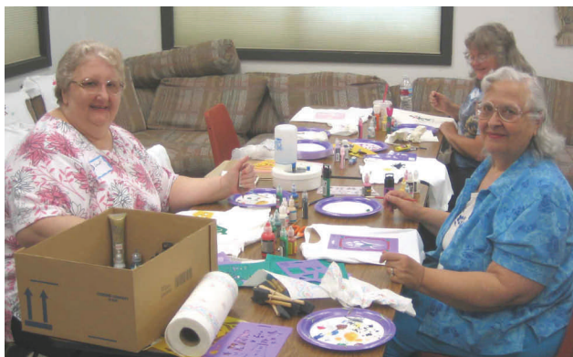
Railettes were busy making shirts for the homeless.