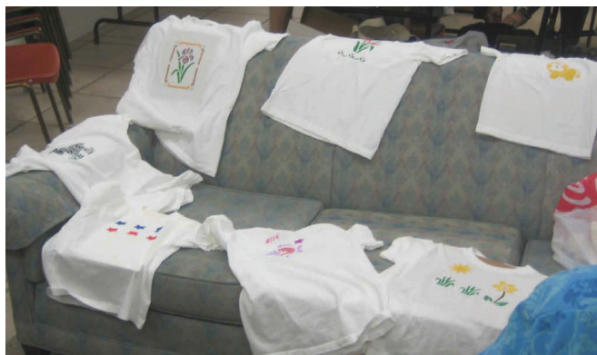
Those are some great looking shirts!