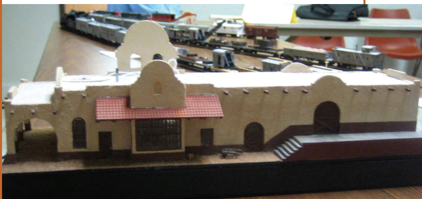
Below: The photo contest entries.