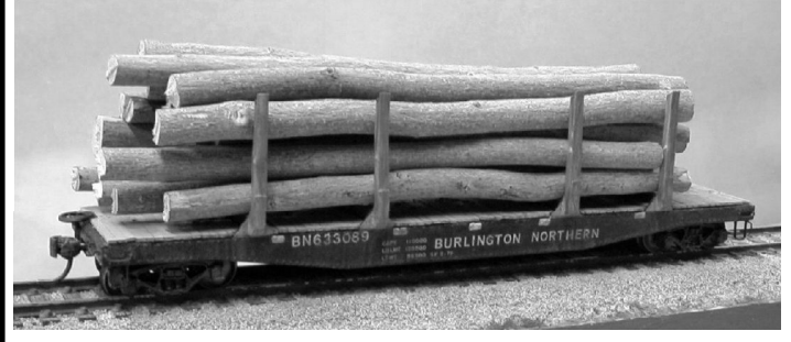
Rolling Stock - Kit: BN Log Flat Car #633089 - By: Alan Barnes MMR