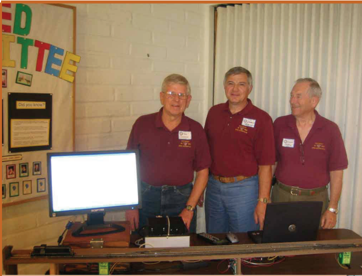
The guys from the Scottsdale Model Railroad Club gave a clinic on DCC turnout control, reporting and occupation detection.