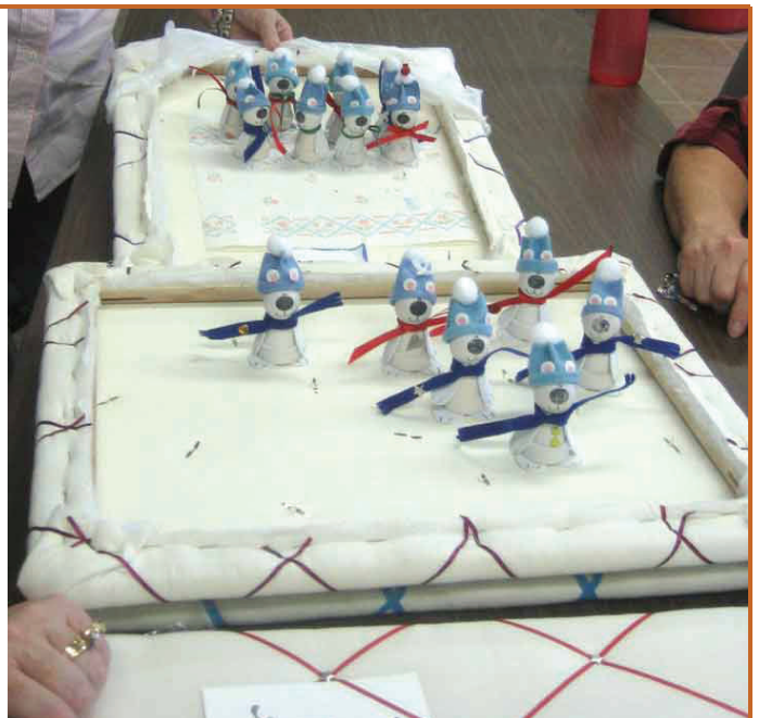
The Railettes were busy again. Great French Bulletin Boards!