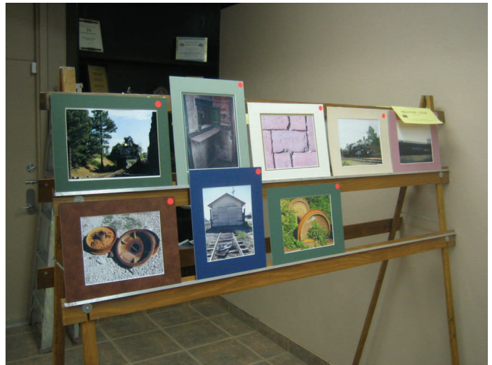
There were some great entries in the photo contest.

CHECK THE NMRA WEBSITE AT: WWW.NMRA.ORG/ACHIEVEMENT