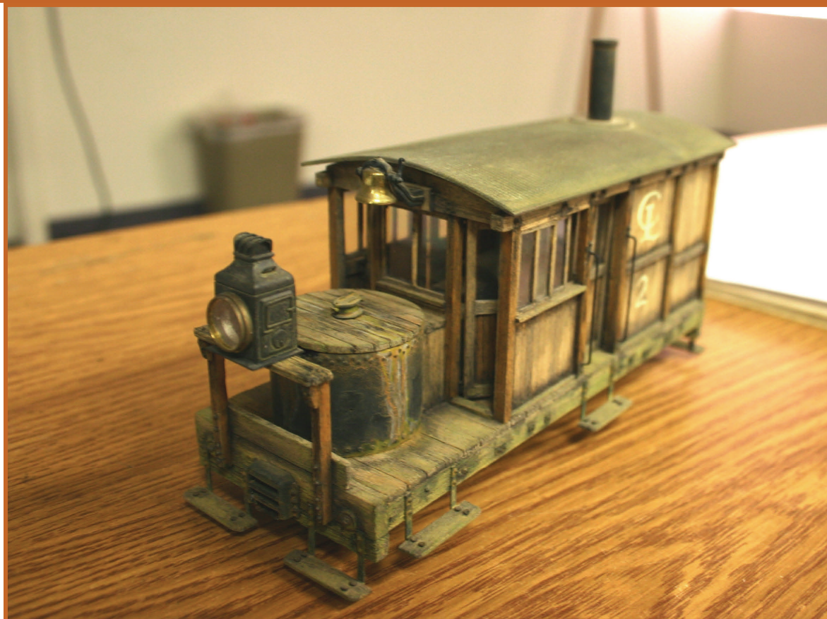
First Place - Motive Power Open - Paul Chandler