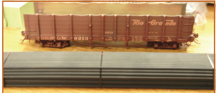
First Place - Rolling Stock Open - Don Stewart

Until then, happy modeling and I hope to see you in Flagstaff.