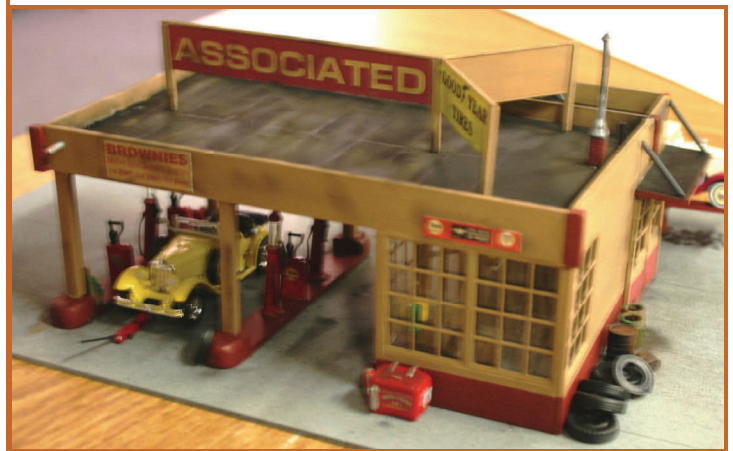
1st Place - Structures Kit - David Irick