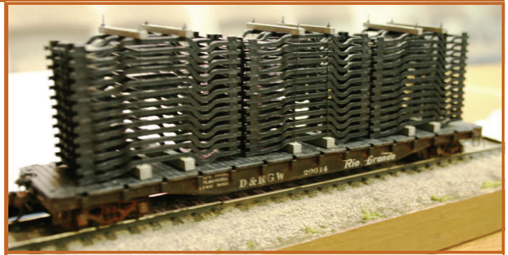
1st Place - Rolling Stock Kit - Alan Barnes, MMR