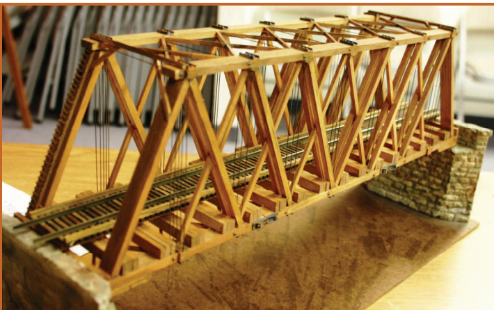
2nd Place - Structures Kit

Our first 'Lenny's Challenge' was a big hit. There were some great models on display. We'll have a Lenny's Challenge in Flagstaff too!