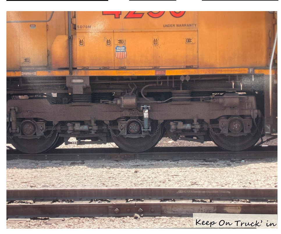
Keep on Truck' in