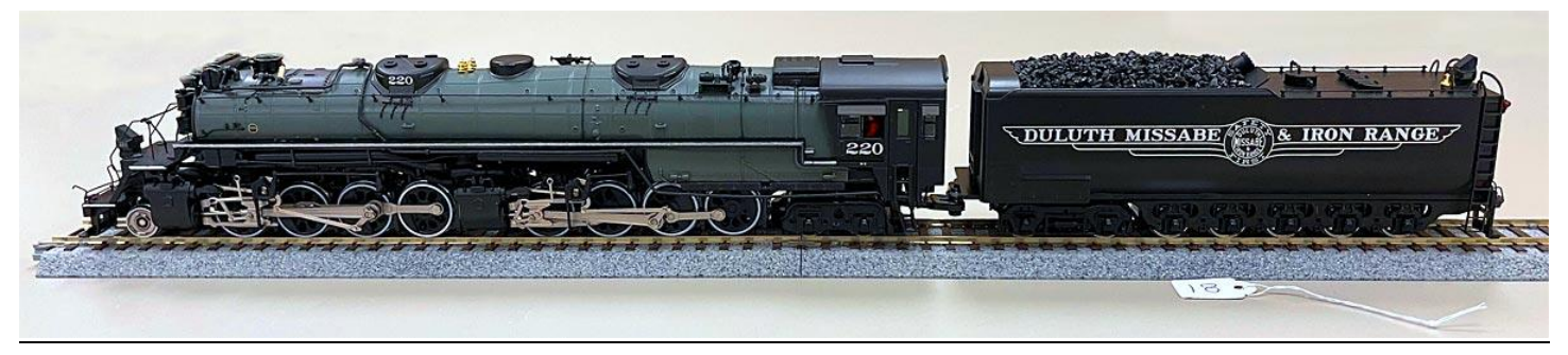
HO scale Yellowstone 2-8-8-4