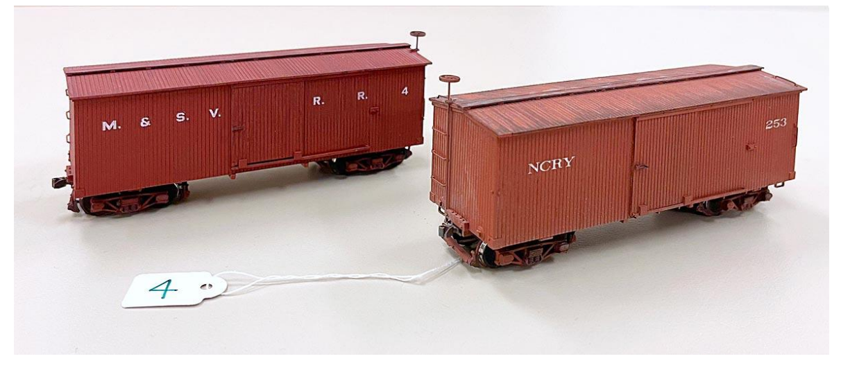
Sn3 Carter Brothers 8 Ton Box Cars