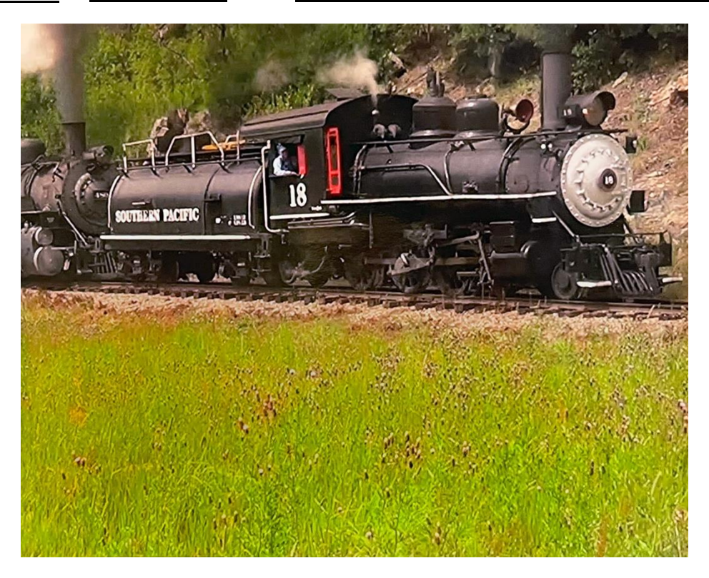
<u>Double Header SP #18 with D&S Engine</u>