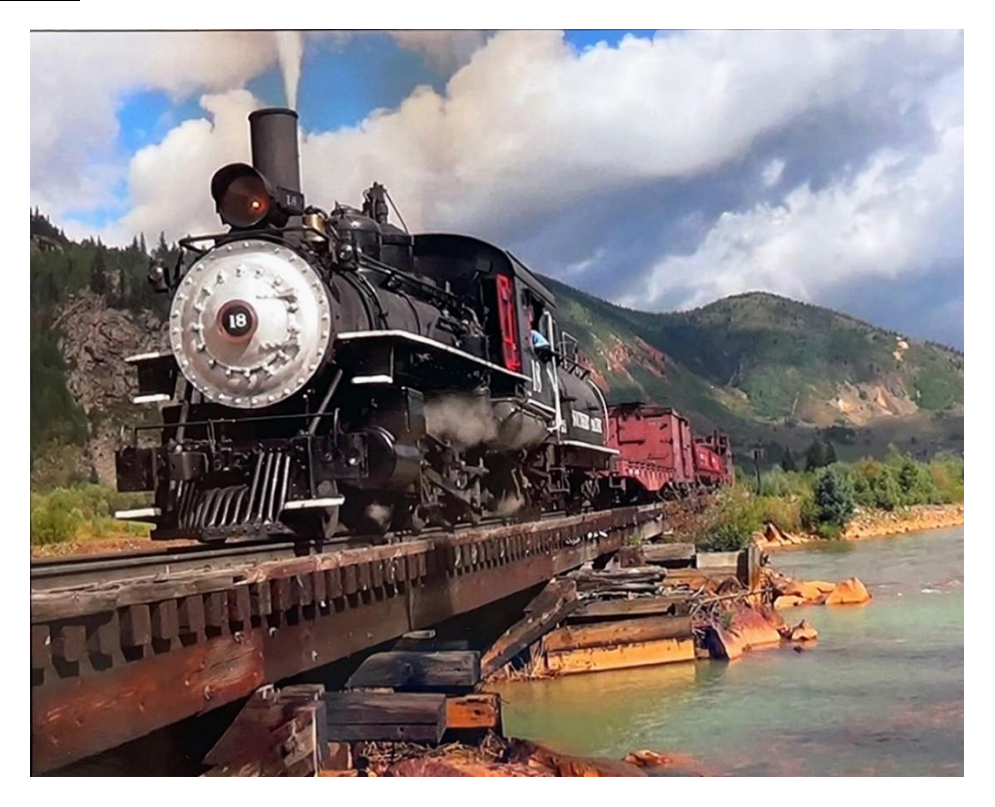
2<sup>nd</sup> Place Allen Greger SP #18 Freight Train

<u>1<sup>st</sup> Place</u> <u>Allen Greger</u> <u>Toltec Creek</u>