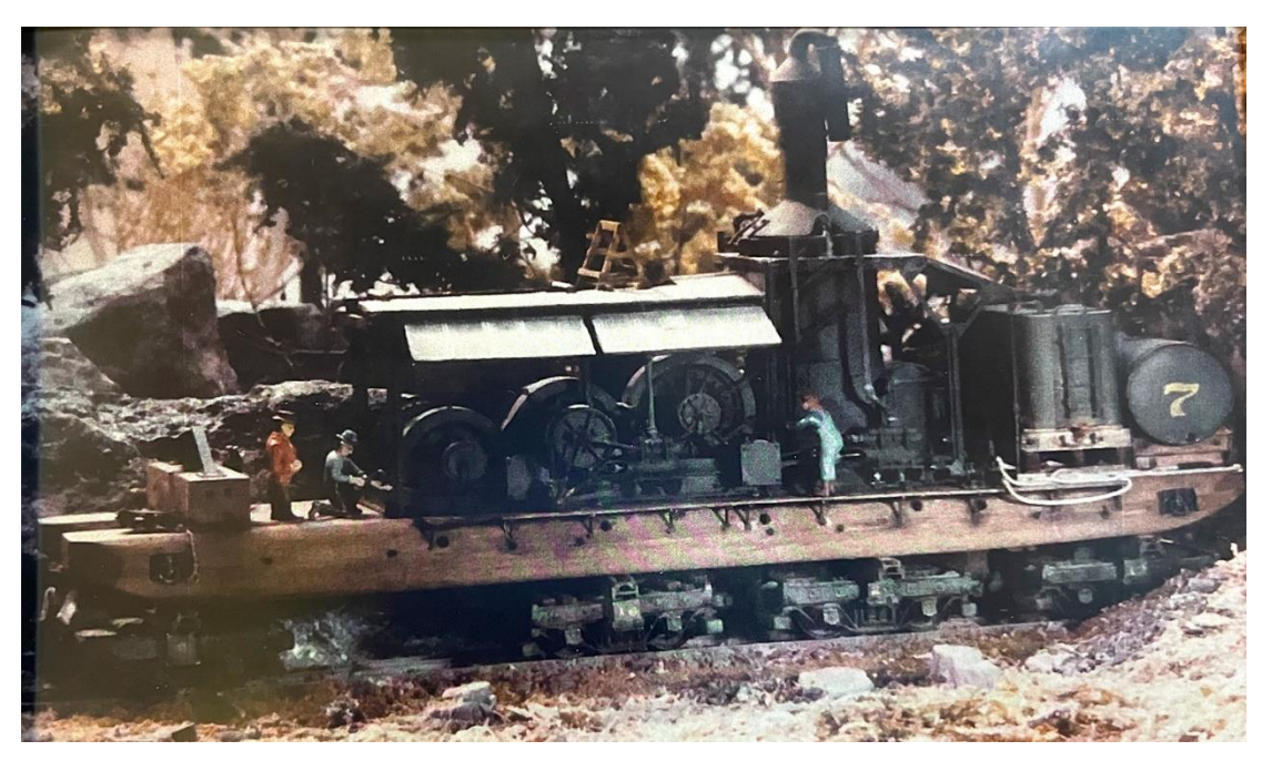
<u>1st Place</u> <u>Allen Gross</u> <u>Skidder on the High Line</u>