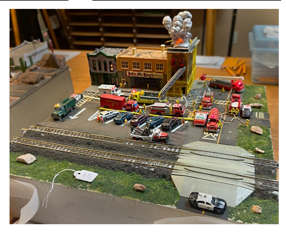
With Flashing Red Lights on the Emergency Vehicles