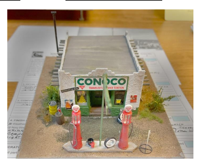
2<sup>nd</sup> Place Geoff Hamway