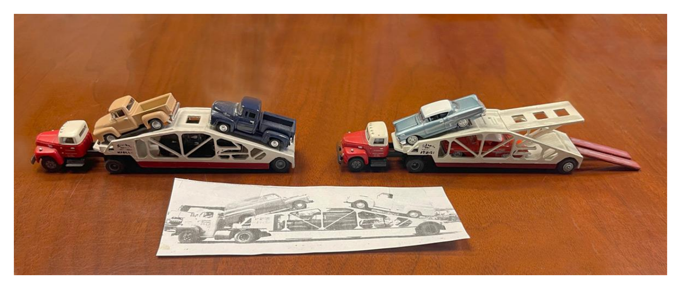
*3D Printed Trailers

<u>1<sup>st</sup> Place</u> <u>Don Ball</u> <u>Car Haulers</u> <u>Scratch Built</u>