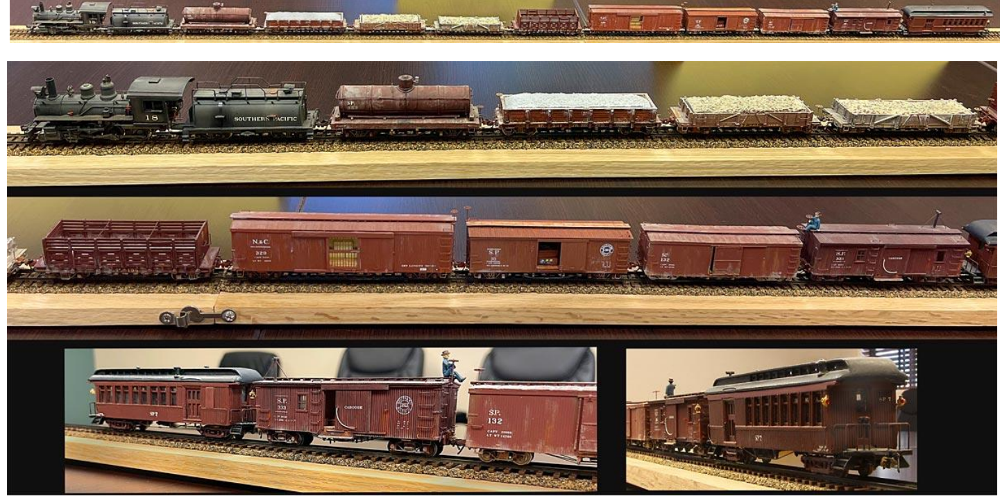
*Cars are based on Prototype SP Narrow Gauge Cars