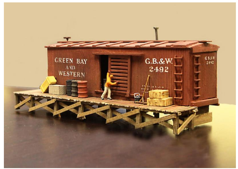
<u>1st Place</u> <u>Ken Wolfe</u> <u>Freight Shed- Box Car</u> <u>Kit Bashed/Scratch Built</u>