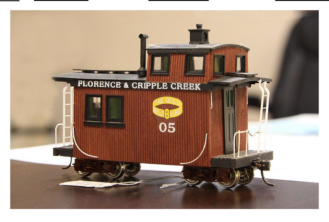
3<sup>rd</sup> Place Jim Bullock