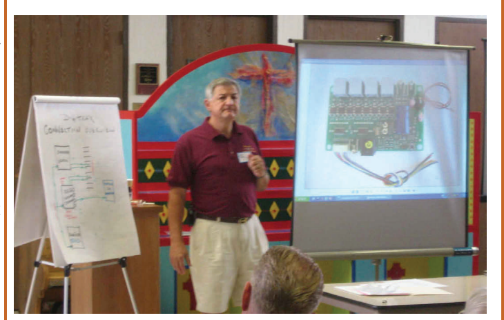
The Scottsdale Model Railroad Club's three presenters gave a clinic on DCC Train Control, Reporting and Occupancy Detection.

Account Balance as of June 22, 2007 $ 6972.28