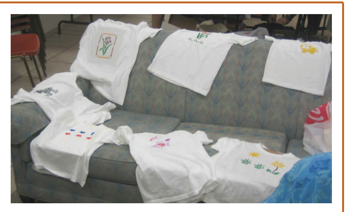
Those are some great looking shirts!