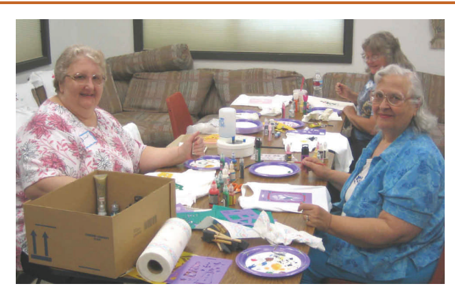
Railettes were busy making shirts for the homeless.