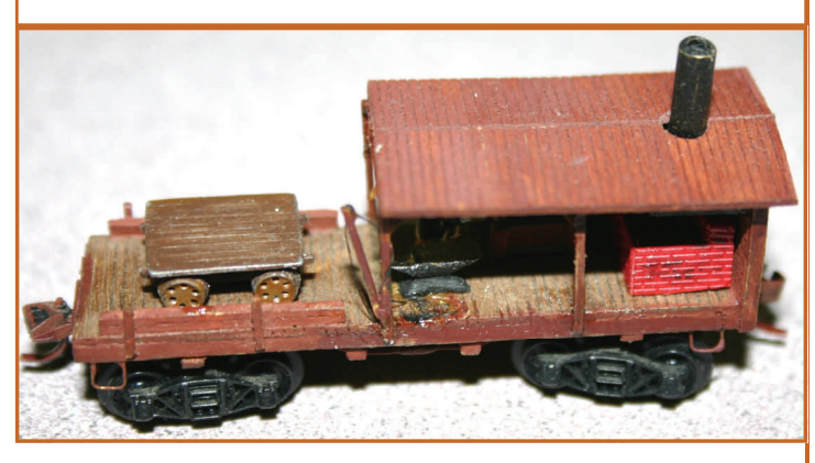
2<sup>ND</sup> PLACE - ROLLING STOCK KIT - DON STEWART