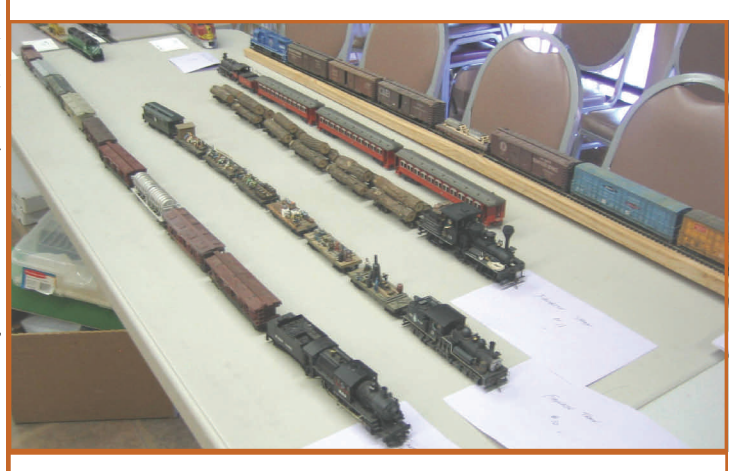
WHAT A GREAT TURNOUT OF FAVORITE TRAIN ENTRIES!

I hope this discussion of the Division's expenses and revenue helps all of you to understand the Division's finances better. If you have any questions, feel free to ask me at a Division Meet or via email/regular mail or telephone.